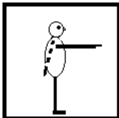
I acknowledge your white flag.