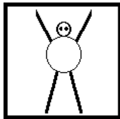
Clear for take-off