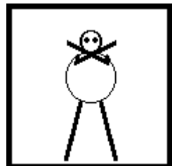
Cancel all previous instructions. Wait.