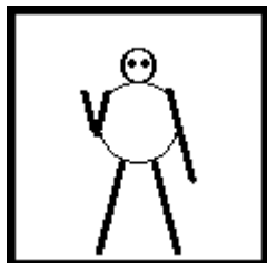
Stay on ground; follow instruction of my right hand.